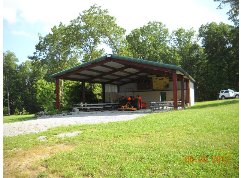
Pavilion at the Little River Property, Menlo, GA

This course will include field exercises at cliffs and caves in northwest Georgia. Daytime highs are likely to be in the 50s to 60s, with nighttime lows potentially near or below freezing. Come prepared for the possibility of rain. We encourage students to bring folding camp chairs for the classroom and rope gym sessions.