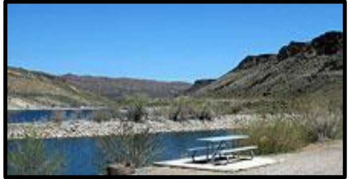
Gunlock State Park

The seminar will be based at Gunlock State Park Campground , 20 miles from St. George, Utah. The facility includes vault restrooms, picnic tables, and a metal building that will be used for classroom and rope gym activities. Please bring food for high-energy activities and camping gear appropriate for the forecast. Long-range forecast temps for the weekend are high 80F low 40F but actual conditions may vary. Please come prepared.